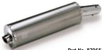
Part No. 8796536