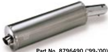
Part No. 8796490 ('99-'00) Part No. 8796491 ('01-'03)