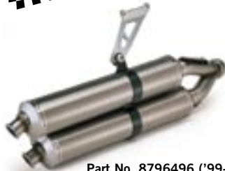
Part No. 8796496 ('99-'00) Part No. 8796497 ('01-'03)