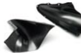
EXTRACTORS, RIGHT AND LEFT Part No. 8796779