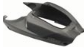
REAR SEAT SURROUND Part No. 8791229