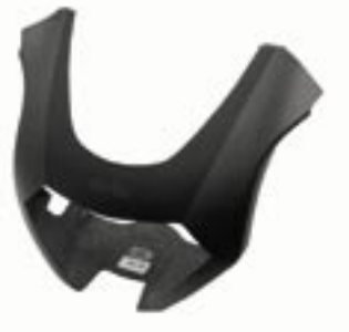
FRONT FAIRING Part No. 8791224

Low in weight, high in prestige. Made from carbon fibre and Kevlar with a transparent opaque finish, these components further reduce the weight of the machine while conferring an authentic racing look. A choice of 9 different parts in carbon fibre (front fairing, rear seat surround, water reservoir tank cover, belly pan, dash cover, front mudguard, rear mudguard, right and left air intakes), and 3 in carbon/Kevlar (right and left radiator covers, right and left heel plates, right and left side fairings).