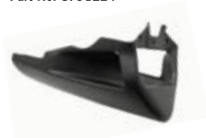
BELLY PAN Part No. 8791222