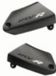
AIR INTAKE, RIGHT & LEFT Part No. 8791226 and 8791227