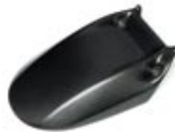
REAR MUDGUARD Part No. 8796783