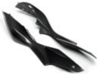
SIDE PANELS, RIGHT AND LEFT Part No. 8796784 and 8796785