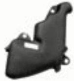
WATER RESERVOIR TANK COVER Part No. 8791221