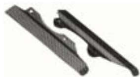
RADIATOR COVER, RIGHT & LEFT Part No. 8791230 and 8791231