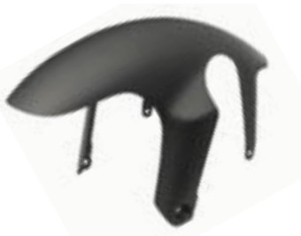
FRONT MUDGUARD Part No. 8791225