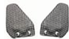
HEEL PLATE, RIGHT & LEFT Part No. 8791213 and 8791214