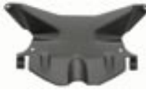
DASH COVER Part No. 8791223