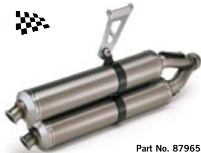
Part No. 8796537