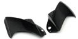
HAND GUARDS Part No. 8796782