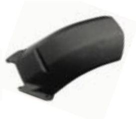
REAR MUDGUARD Part No. 8791228