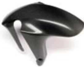
FRONT MUDGUARD Part No. 8796055