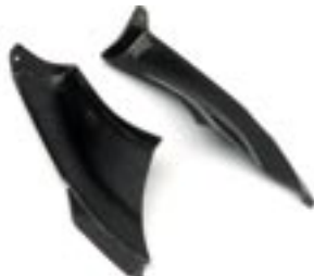
SIDE FAIRINGS, RIGHT AND LEFT Part No. 8796780