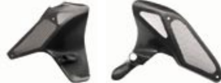
SIDE FAIRING, RIGHT & LEFT Part No. 8791215 and 8791216